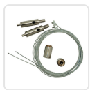
GL-0091 Suspend Kit